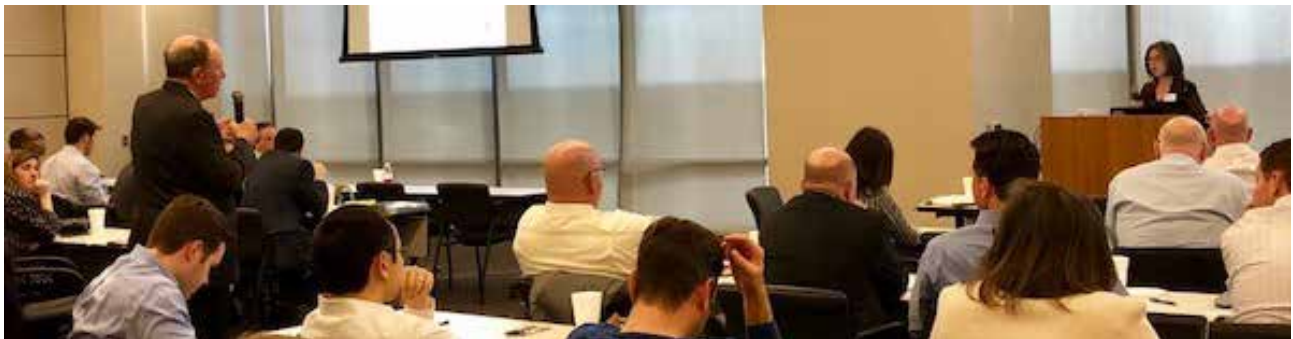
Scenes from the Houston Chapter's Primer on An Introduction to Federal Oil Pipeline Regulation.