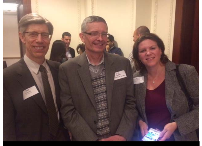
Attendees at the 2016 Western Chapter Annual Meeting on February 25-26, 2016 in San Francisco, CA