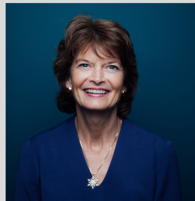
SENATOR LISA MURKOWSKI Senator, Alaska U.S. SENATE

Senator Murkowski could not be with us in person today, but she has accepted the EBA President's award in a pre-recorded message.